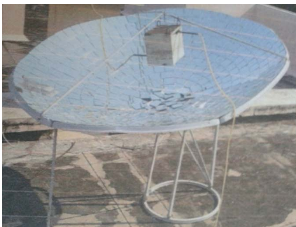
Fig.3 Parabolic solar still

Figure 3 shows the experimental arrangement of the parabolic disc type solar still. The Parabolic Solar still consists of the parabolic disc, absorber tray, flexible PVC tube and measuring jar. Reflective glass pieces are fixed over the top surface of the parabolic disc. The Parabolic Disc concentrates the solar radiation in the point focus and tends to fall on the copper tray. The diameter of the Parabolic Disc is 1.2 m. The absorber tray is of rectangular shape with dimension 10 cm x 10 cm. The absorber tray made of copper is placed at the focal point of the parabolic disc. And the tray is coated with black paint to increase the rate of absorption. The higher temperature is achieved at the focal point. The water is flown on the top side of tray. The insulation material is wounded over absorber tray to reduce the losses due to heat transfer from the tray to the atmosphere.