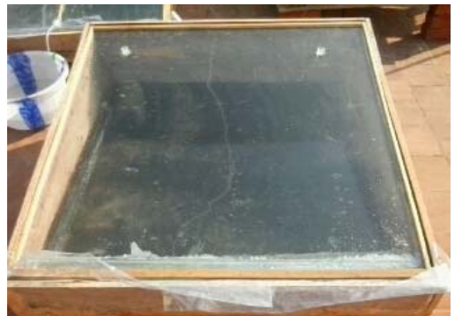
Fig.2 conventional solar still

The schematic diagram of a conventional single basin solar still is shown in Figure 1. The conventional solar still arrangement contains a storage tank, solar still, measuring jar, temperature measuring devices and pipe networks. And the figure 2 shows the conventional solar still arrangement. The solar still basin is made up of 2mm thick Galvanized Iron (GI) with 1m x 1m dimension at the depth of 0.12 m. The still basin is painted with matte black colour completely, in order to increase the rate of absorption of solar radiation.