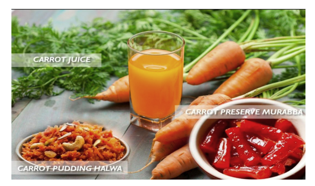
Fig. 1. Three preparations of carrots: juice, preserve and pudding. Heating is essential to disrupt the thick plant cell wall, releasing the Phytosnutrients within the cells. Frying in ghee further enhances bioavailability by providing lipid, promoting the absorption of hydrophobic non-polar carotenoids.

enhancers or adjuncts (anupana). In general the use of lipids in Ayurveda may be classified into following three types: